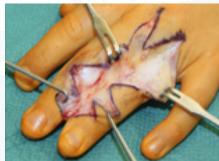
Fig. 4: The neurovascular bundles are exposed incl. their bifurcation

After skin incision marking, the skin flaps are carefully raised. It is important not to harm the peritendineum and its supplying vessels (Fig. 3).