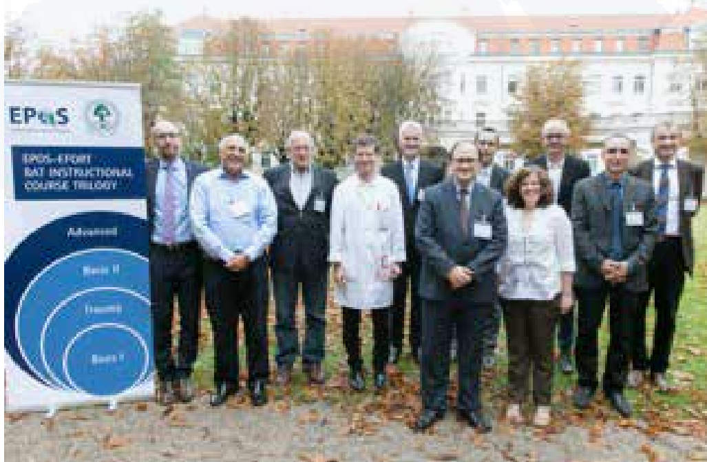
Faculty members are in the hospital's garden (6th Oct 2016)